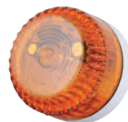
Solex Amber - White Base